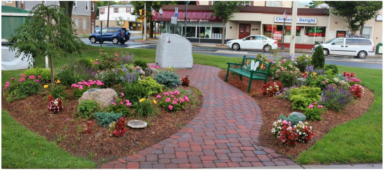
The completed garden as it appeared during the summer of 2014