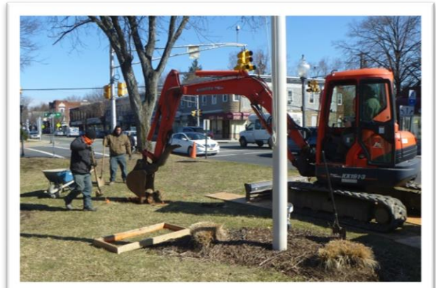
Digging the foundation – April 1, 2014

On April 1 st the completed sculpture was delivered and laid on the foundation and covered until April 3, 2014, when the unveiling and dedication ceremony was held. It is 4'3" to the tip of the butterfly, which was Joan's height when she died.