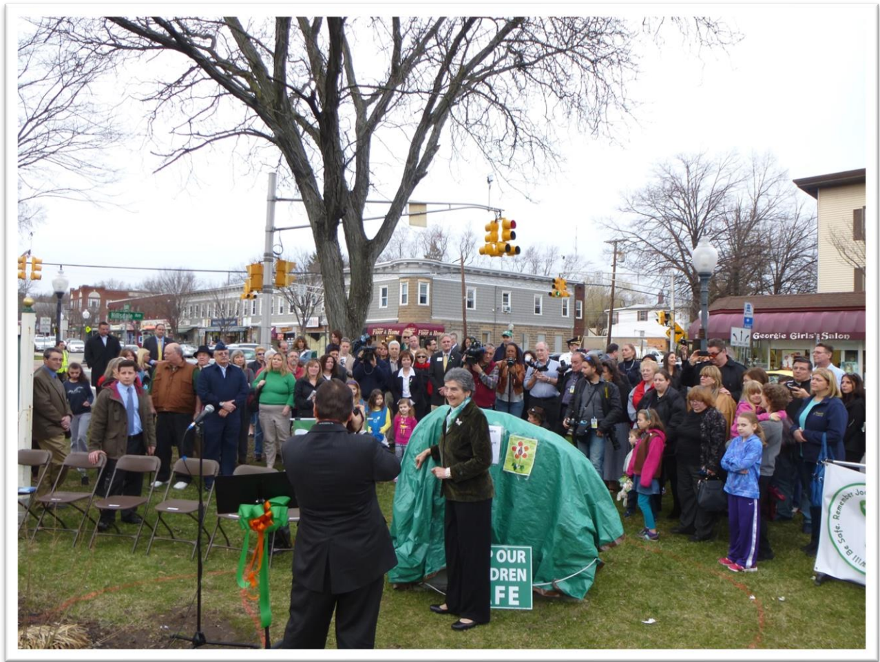
Sculpture unveiling – April 3, 2014

The pathway to the sculpture was constructed on April 21 st and 22 nd . After that, the garden work began with the placement of 13 large moss stones on April 25 th . The next day all of the trees and shrubs were planted.