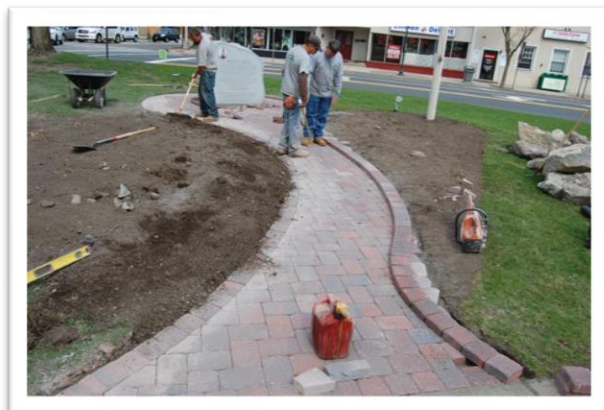
Raymond Brothers work on the path

The pathway to the sculpture was constructed on April 21 st and 22 nd . After that, the garden work began with the placement of 13 large moss stones on April 25 th . The next day all of the trees and shrubs were planted.