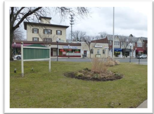
This is how the site of the garden appeared on March 12, 2013.